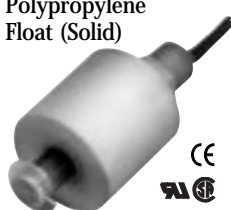
Polypropylene Float (Solid)

With Polypropylene stem and float, switch offers broad chemical compatibility.