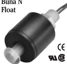
Buna N Float

With Polypropylene stem and float, switch offers broad chemical compatibility.