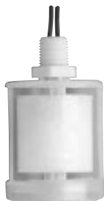
Cut-away version shown

Compact, all-polypropylene switch with slosh shield is ideal for use with turbulent liquids in small tanks. FDA approved materials.