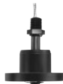
Part No. 76707 For Low Level

For detecting levels as low as 5/8" from tank bottom. Use in water, gasoline, some oils and chemicals.