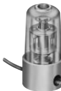
Part No. 46999 Bottle Level

For external mounting on tanks too small to accommodate internally mounted switches. (See note below)