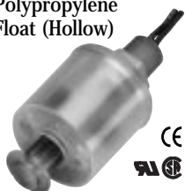
Polypropylene Float (Hollow)

Features a low specific gravity float offering broad chemical compatibility to satisfy a wide variety of applications.