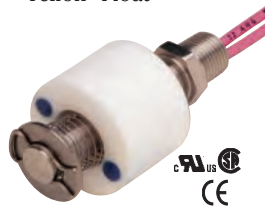
LS-1700 Series – Teflon® Float