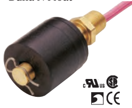
LS-1700 Series – Buna N Float