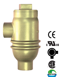
3/4" NPT Ports

LS-159000 Series – Low Cost, Compact Aluminum Housing