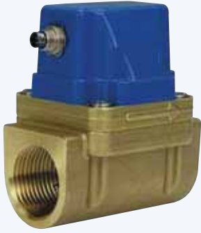
G-BR – series

The pipe section is constructed of copper alloy and fitted with BSP/NPT threads 15, 20 and 25 mm (1/2", 3/4" and 1").