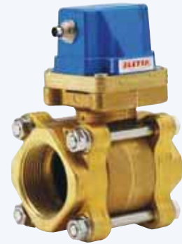
GL – series

The pipe section is constructed of 316L stainless steel and fitted with BSP/NPT threads 15, 20 and 25 mm (1/2", 3/4" and 1").