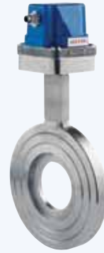
FSS – series

The pipe section has a flanged (wafer) process pipe connection and the material is epoxy polyester coated cast iron in sizes up to 400 mm (16”).