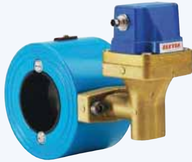
FA – series

The pipe section has a flanged (wafer) process pipe connection and the material is epoxy polyester coated cast iron in sizes up to 400 mm (16”).