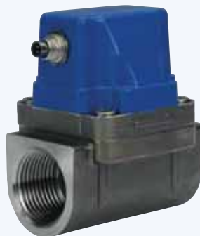
G-SS – series

The pipe section is constructed of copper alloy and fitted with BSP/NPT threads 15, 20 and 25 mm (1/2", 3/4" and 1").