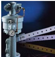
GB52S / GB53S Series