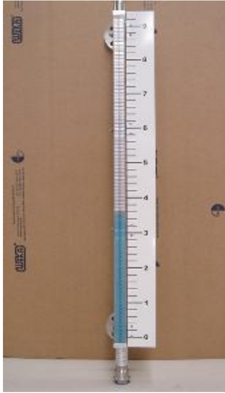
Models with SS or Colorbond scales