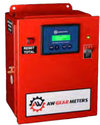
Industrial Enclosure System