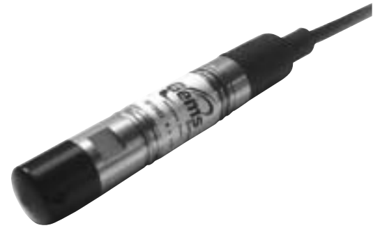
Dimensions mm (inches)