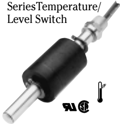
TH800 Series Temperature/Level Switch

Level monitoring and temperature switch in a single unit. Intermediate in size; single-setting temperature sensor is in bottom of stem.