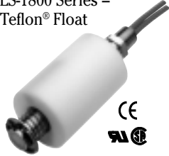
LS-1800 Series – Teflon® Float