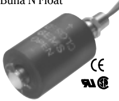
LS-1800 Series – Buna N Float