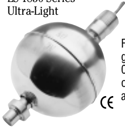
LS-1850 Series – Ultra-Light

For use in liquids with specific gravities as low as 0.40 to 0.70. Excellent in a wide range of chemical applications. Also available with brass stems.