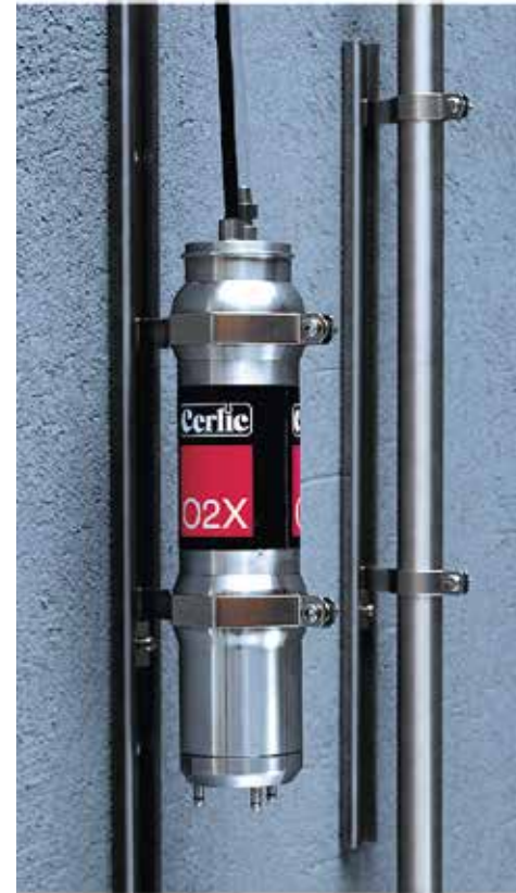
SS Slide rail assembly for easy installation and servicing. Available in two sizes 20 mm Ø for pHX, ReX and FLX and 66 mm Ø for O2X and ITX sensors. The rail has field adjustable stop. It's easy to install and to inspect sensors for cleaning and calibration.