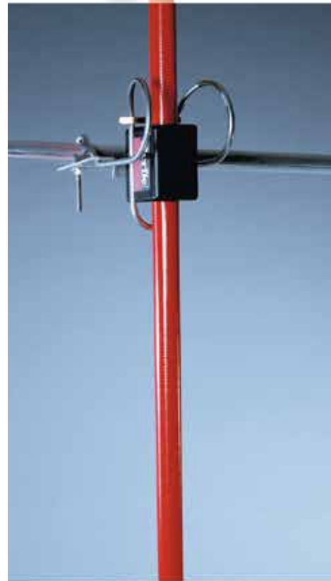
The flexible spring-loaded mounting bracket is designed to withstand turbulent conditions. The fiberglass telescopic rod is extendable to 4 meters and can be removed easily for inspection.