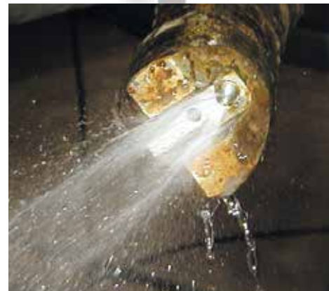
The automatic flushing device has no moving parts and ensures minimal maintenance and enhanced reliability. The flushing nozzle uses water or compressed air.